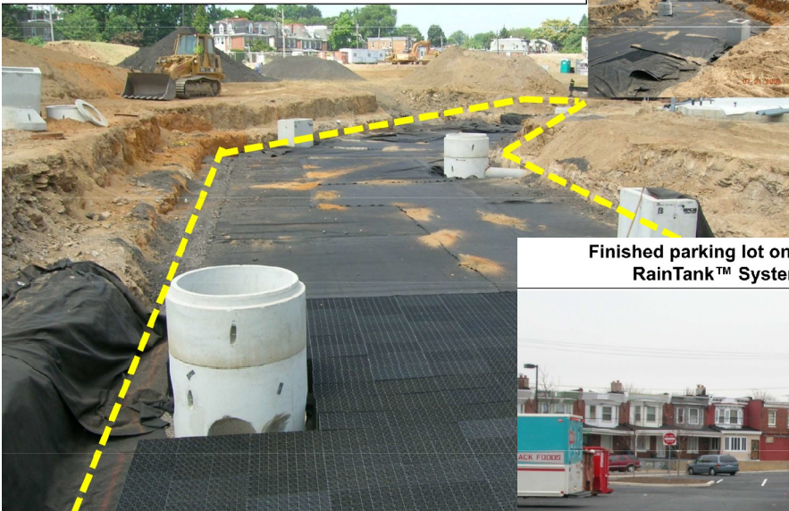
Finished parking lot on top of RainTank™ System

RainTank's modular versatility allowed for the system to fit into this projects irregular footprint.