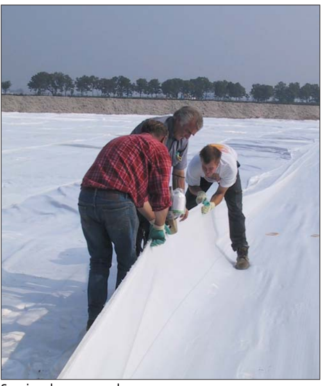
Sewing large panels