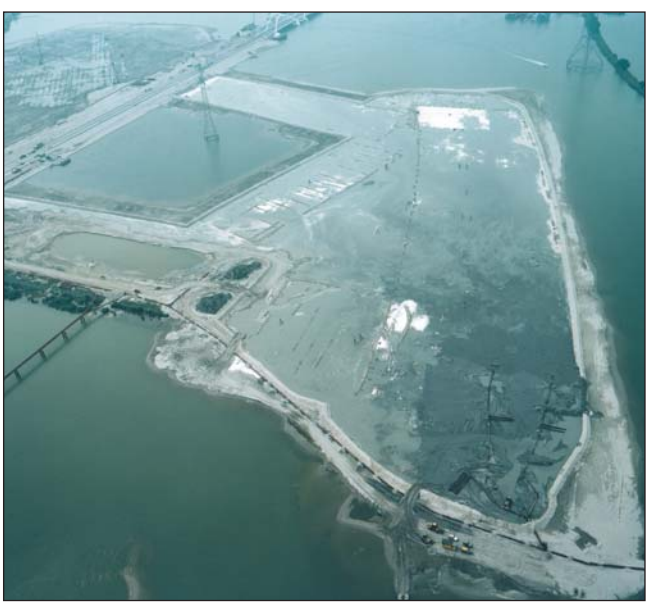
Hydraulic fill operation

woven polyester with an ultimate tensile strength of 400 kN/m was required.