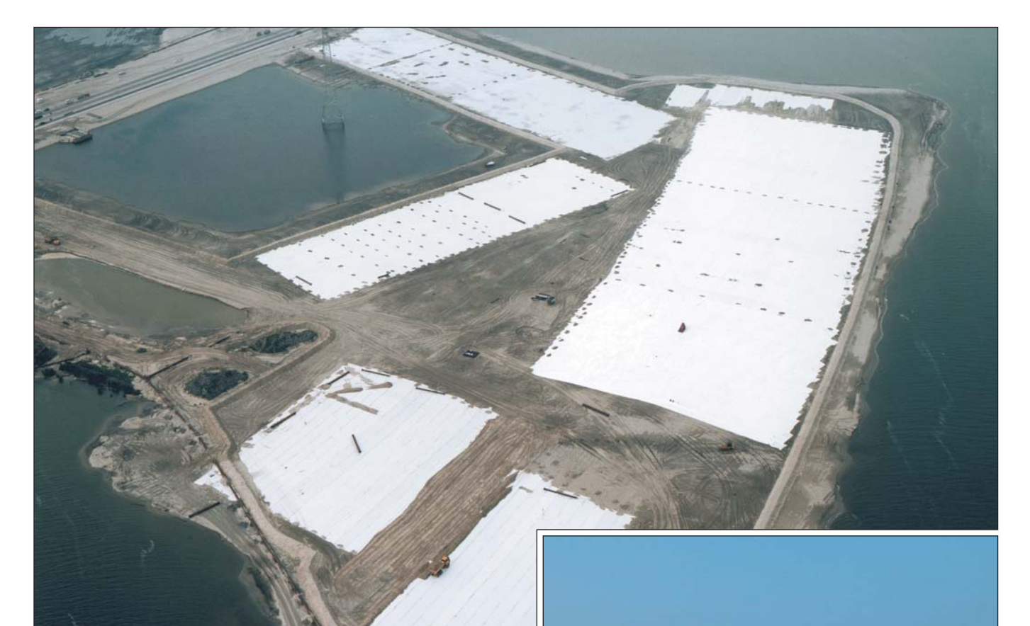
Aerial view of Steigereiland, IJburg