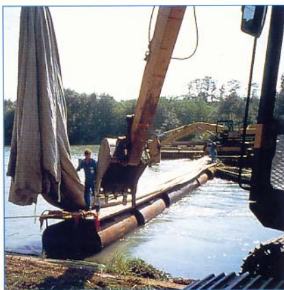
Placing a panel on the barge for installation

From the various renovation proposals Incomat ® Standard, the geosynthetic sealing system, was chosen. The Incomat ® concrete mattress offered several advantages. It provided under-water execution, rapid installation and uncomplicated