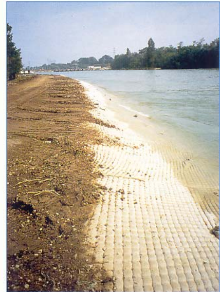
The restored canal access after the mattress installation

concrete filling. By covering the embankment with Incomat® the impermeability required by the operator was achieved. At the same time the embankment was protected from severe erosion effects.