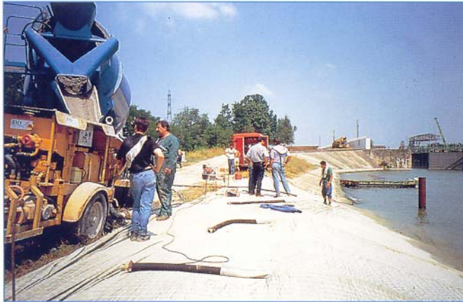
Filling the mattress using a concrete pump