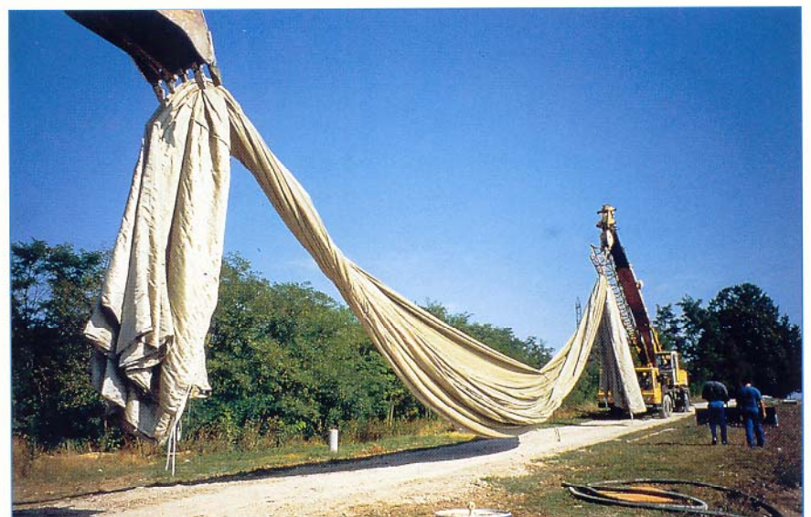
Bringing a panel onto site