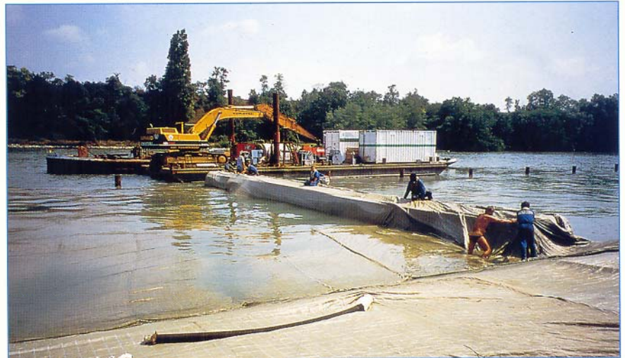
Captions: Placing a panel on the barge

In Autumn 1993 a considerable damp area was noticed on the outer slope of the embankment, which prompted the operator to carry out a further investigation. Bathymetric measurements of the canal profile indicated that the clay layer had severely eroded at several points, the concrete slabs were worn