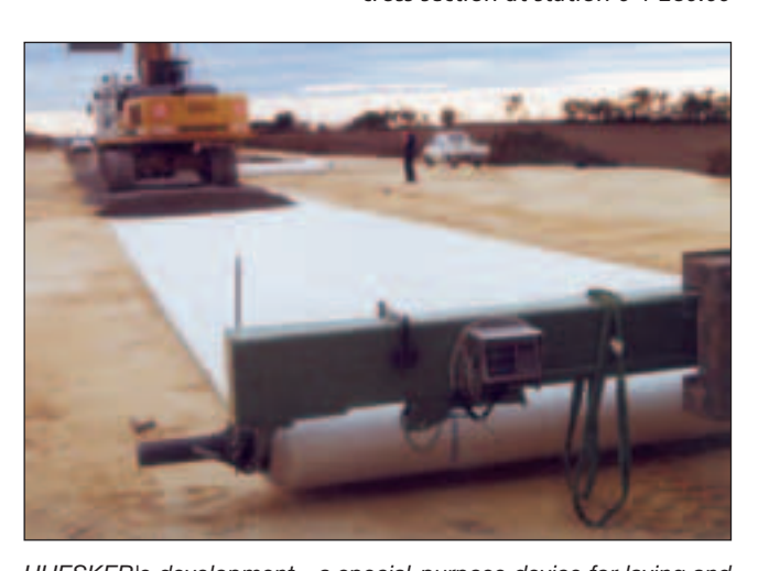
HUESKER's development - a special-purpose device for laying and pre-tensioning Stabilenka ® 1000/100

It is important to place sink-hole bridging reinforcement precisely and to install the lengths in a taut condition. HUESKER have