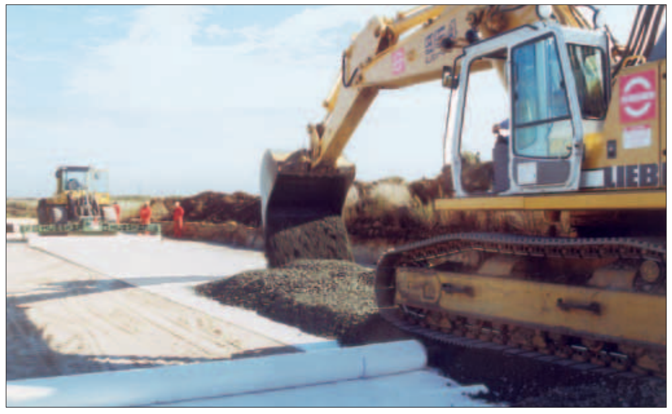
Forward placement of the stone layer onto pretensioned Stabilenka ® 1000/100

The Zeitz-Theissen bypass was constructed in 1999 in the course of joining the B180 to the B91. A 480m length of newly constructed road in this area traverses an abandoned mineworking, so the risk of subsidence was highly rated. As a result it was decided to include a high-tensile polyester fabric, Stabilenka® (tensile strength: 1,000 kN/m lengthwise and 100 kN/m widthwise), as sink-hole bridging reinforcement. According to a mining analysis carried out by the Halle Mining Authorities, this old mining region can be prone to funnel-shaped sink-holes (cavities) up to 3.5 metres in diameter (D). The section of road at risk is an embankment region, with fill heights (H) of 2.0 to 2.5 metres above the reinforcement level.