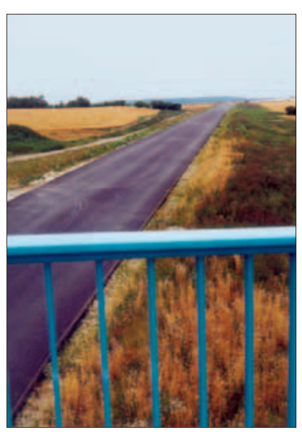
Zeitz-Theissen Bypass - completed

The static calculations for the sink-hole bridging reinforcement were produced by HUESKER Synthetic's engineering applications department and approved following examination by the Halle Highway Construction Office. The design of the bridging effect was produced to British Construction Standard BS 8006. Also taken into account with regard to the load-bearing behaviour of geosynthetic reinforcement were the designload standard used in Germany (DIN 1072) and the 'Code of Practice for the Use of Geotextiles and Geogrids in Highway Earthworks Construction', issued by the FGSV [Research Institute for Highways & Transportation] in August 1994. Given the relatively flat condition of the reinforcement (H/D = 2.0/3.5 = 0.57 up to H/D = 2.5/3.5 = 0.71), the loadbearing behaviour was best reflected by the British design method, as a permanent load reduction or arching effect could hardly arise in this situation. The advantage of this design method was its capacity to forecast the anticipated settlement behaviour of carriageway surface level as a function of selected reinforcement. The method also made it possible to determine the 'appropriate' reinforcement for the carriageway's permissible settlement level.