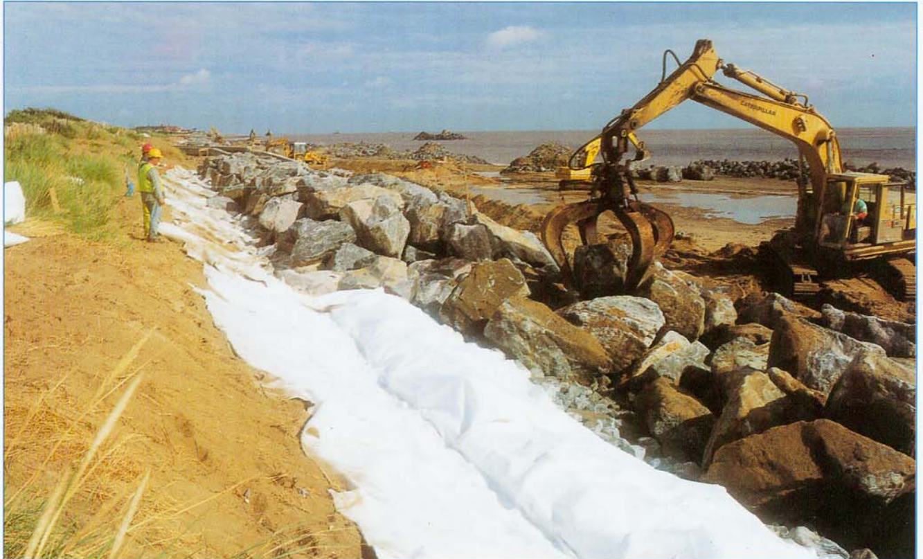
Skegness (Beach Training Works)